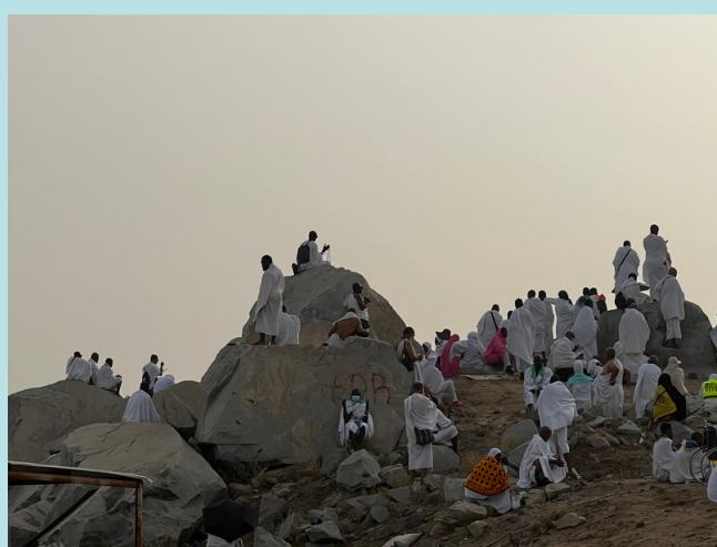
Duaas for the liberation of Palestine are accepted everywhere, especially on Arafat

Again, the freedom of the mind was evident. There was no asking for money, no plea for desperately needed supplies. All they asked for was our prayers and awareness of their plight. A few days later I was blessed to be standing clothed in my Ihram in front of the Kabaa. As I circumambulated it during Tawaaf I could hear the Duaas for the liberation of the nation of Palestine. Some cried and some pleaded. The prayer was universal. Our Creator surely hears these pleas. Our resilient and patient Palestinian brothers and sisters, parents and children, all know that liberation will come.